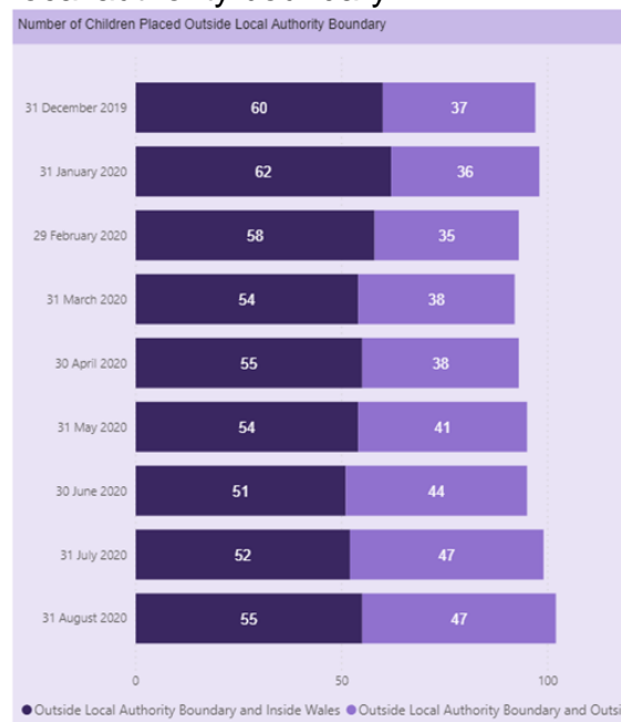
Graph 3 – Number of Children Looked After in residential care placed outside local authority boundary.